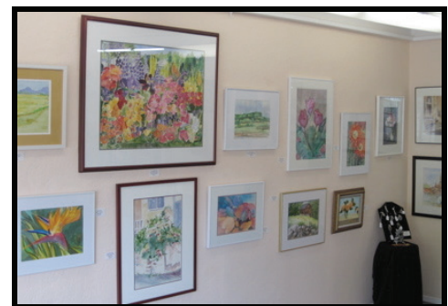
from the Wheeler Gallery archives: Members' Show 2010